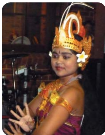
Indonesian Community - Indonesia