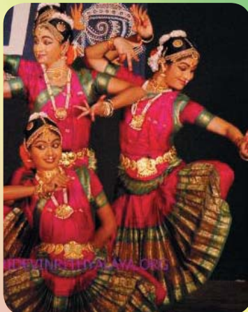
Kalaivani School of Indian Classical Arts - India