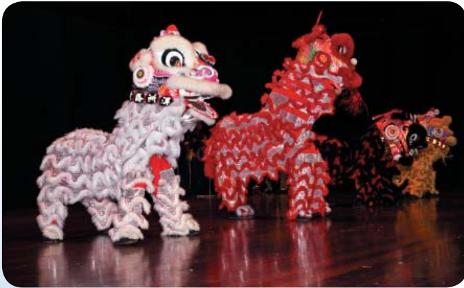
Lion Dances - China