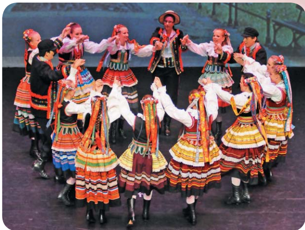
Polish Dance Group Kukuleczka Inc. - Poland