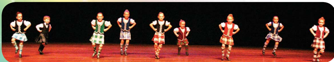
Highland Dance Academy - Scotland