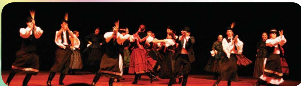
Keszkeno - Hungary (Copyrights to TreffOWA)