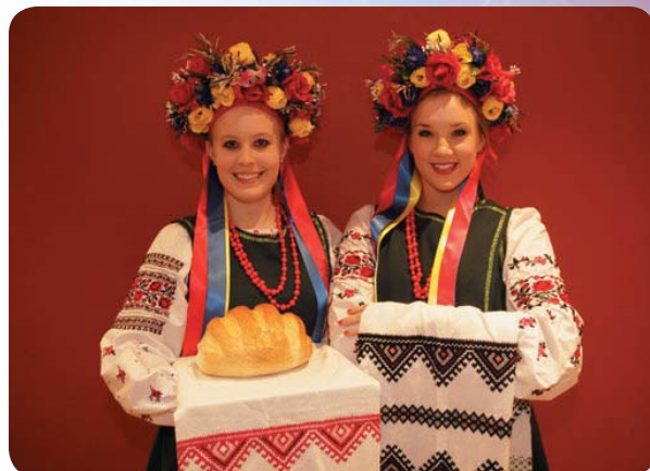
Roztiashka Ukrainian Cossack Dancers - Ukraine