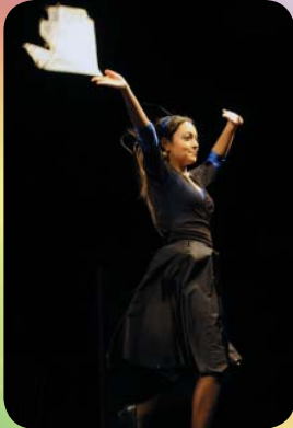
St. Andrew's Greek Dance Group - Greece