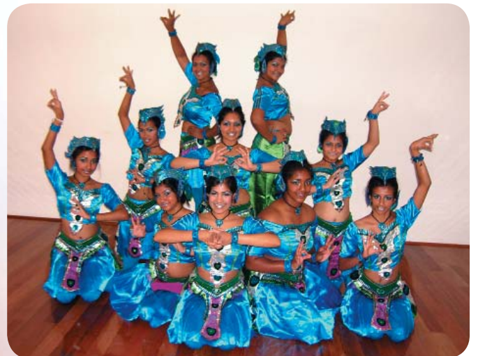
Pavithra Dance Troupe - Sri Lanka