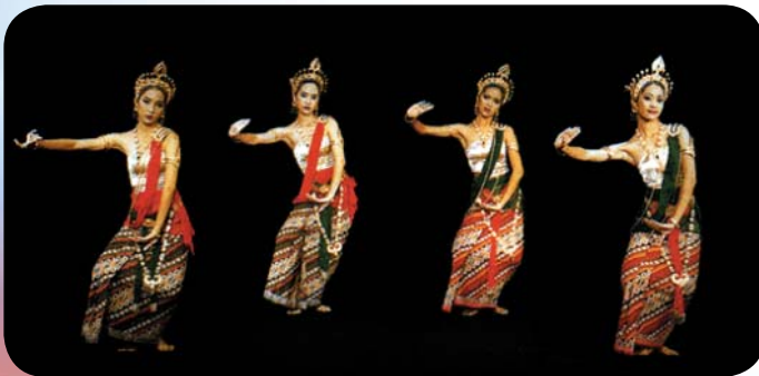
Thai Srivichai Dance - Thailand