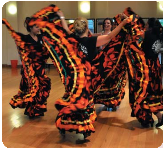
Fantasia Latina - Venezuela