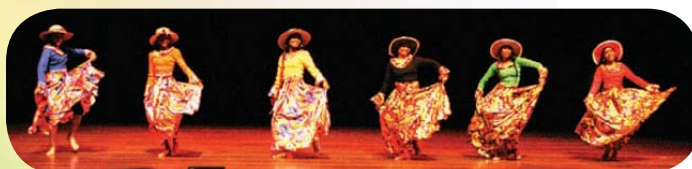
Academy of Sri Lankan Dance, Drama and Music - Sri Lanka