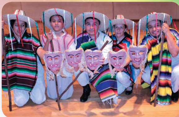
IXTZUL - Mexico